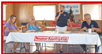
Annual Business Meeting