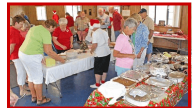
Christmas Dinner with the Family