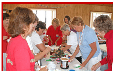
Christmas Cookie Decorating